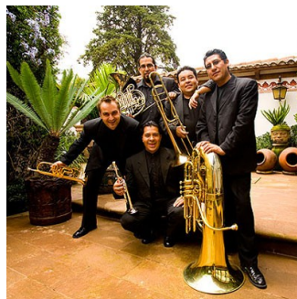
Matales M5 - Performing May 12th in Roseau

The Northern Lights Concert Association's local Board of Directors select each year's performers and attempts to find a wide variety of talent and performance types.